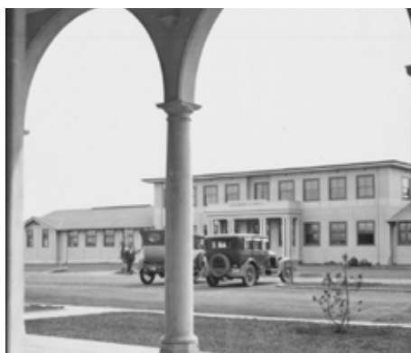
The old Jolimont building, Alinga Street, Canberra, 1929

As they did not use electrical tabulators, the bulk of the work of sorting and counting was done by hand-sorting and manual addition. However, some early mechanical calculating machines were used, particularly for adding.