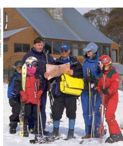
1986 census publicity photo

Since 1921, the collection of the census had been supervised by the Australian Electoral Commission. However, in 1986