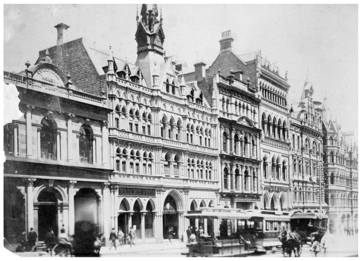
The Rialto Building in Collins Street, Melbourne

While in Europe, Knibbs spent considerable time investigating the amazing newfangled machines that could sort and count information such as that collected in a census. These electrical tabulator machines were very much in vogue in the census offices in Europe and America before the First World War. However, Knibbs rejected them all. He felt that the time it would take to transfer the information from the census schedules to the punch cards, would cause too great a delay to the release of the data. Furthermore, he felt that because the population of Australia was small compared to the countries in Europe, the mechanical tabulators were not necessary.