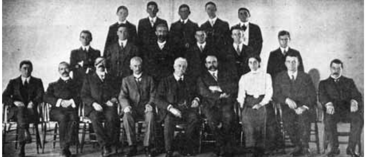
Permanent staff of the Commonwealth Bureau of Census and Statistics

Some of the first workers hired specifically to work on the census were draftsmen. Drawing detailed maps of every part of Australia was essential to getting the collection right. But while the draftsmen drew the maps, local knowledge was used to divide the land into manageable collection areas. The State Supervisors were asked to appoint 'Enumerators'. These managed the collection at a district level. Enumerators were drawn from 'suitable' people such as police magistrates, town clerks, electoral returning officers, clerks of the courts and mining registrars from every local region in Australia. The enumerators were sent large maps of their areas and asked to divide them into collectors' districts. Once they had made their recommendations, the draftsmen then set to work again drawing, by hand, individual maps of every collector's district in Australia.