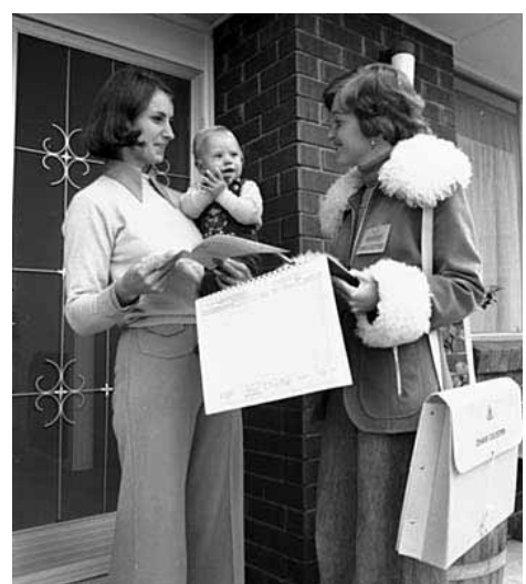
1976 census publicity photo